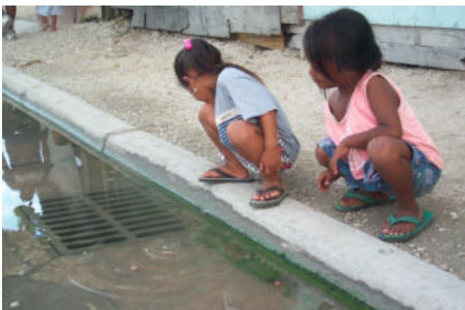
Figure 13: Stagnant water in the street sometimes contain raw sewage

An alternative to the discharge of effluent into the lagoon should be investigated making use of information on other successful raw sewage outfall designs that discharge to the ocean (e.g. Majuro). Hydrodynamic modelling and bathymetry are needed to determine the feasibility of such a venture and could be facilitated through the Coastal Management Unit of SOPAC.