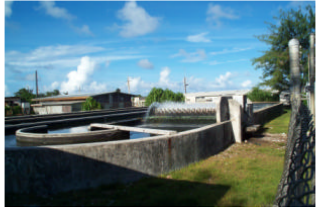
Figure 12: Wastewater treatment plant operational again

Wastewater on Ebeye is collected through a reticulated saltwater sewage system leading to an oxidation pond for secondary treatment before it is discharged via a deep-water outfall to the lagoon. The wastewater treatment plant operated by the Department of Public Works has been known to suffer from consistent operational problems since 1997 (Beatty, 2001). As part of ASPA's assistance to KAJUR the wastewater system has been upgraded. There has been some concern expressed by nearby residents of the oxidation ponds. Apparently when there are strong winds, wastewater is being blown out of the pond into residential areas.