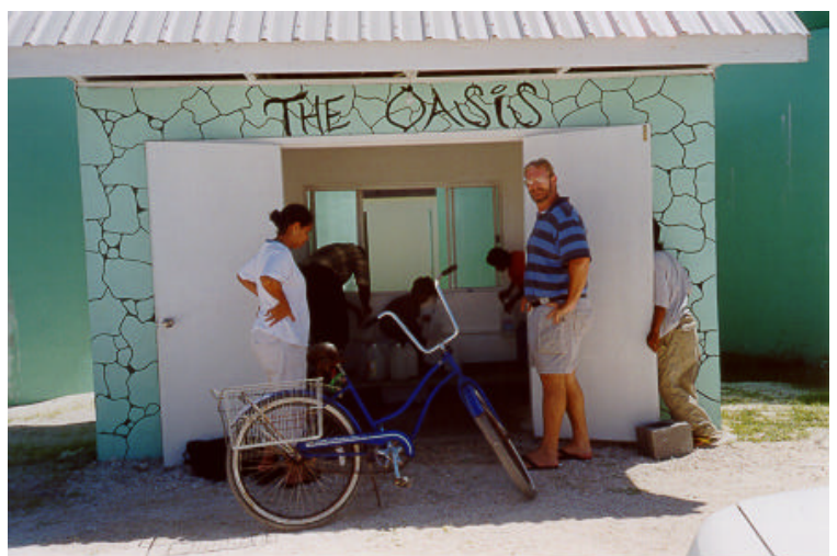
Figure 6 & 7: The Oasis, public water supply free of charge

The cholera outbreak that occurred on Ebeye in the period between 1 December 2000 and 5 January 2001, was found to be caused by the water supply situation. The survey carried out by the Centre for