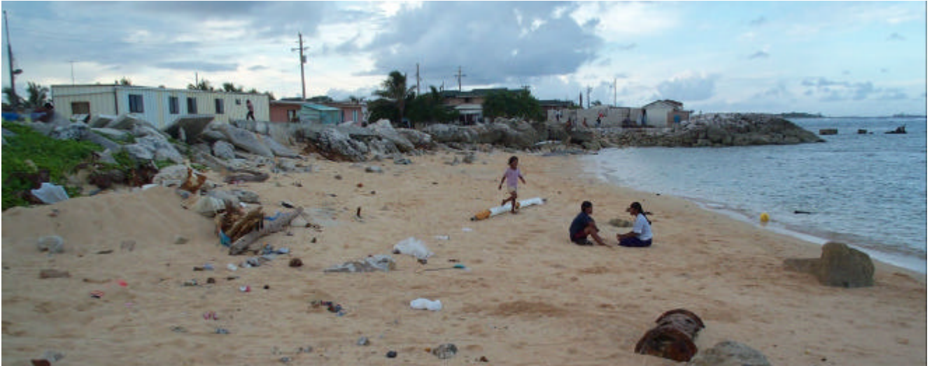
Figure 14: Beaches used for defecation, rubbish dump and play ground