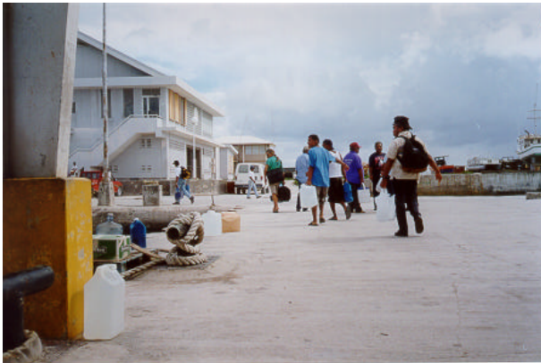
Figure 8: Hauling water to Ebeye with containers, coolers and jugs

Ironically, the majority of patients who contracted cholera were reported to be using water from Kwajalein as their primary water source before onset of their diarrhoea. Despite the availability of good quality water at “The Oasis” free of charge there is apparently distrust in using this water as primary source, which was found out through conversations with several local Ebeye residents by SOPAC staff on this visit. Hence the reason why the practice of collecting water in Kwajalein by commuters is still being carried out.