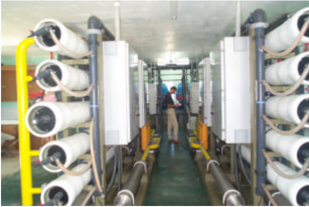
Figure 5: SWRO system (Hydropro Inc., Palm Beach, Florida)