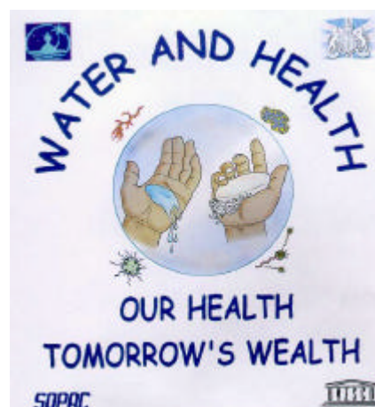
Figure 16: World Water Day 2001 Publication material.

SOPAC through the World Water Day public awareness campaigns can contribute to this reinforced attention. The campaign of 2001 was focused on "Water and Health" and it was suggested that publication material be translated into Marshallese for further use on Ebeye's campaigns.