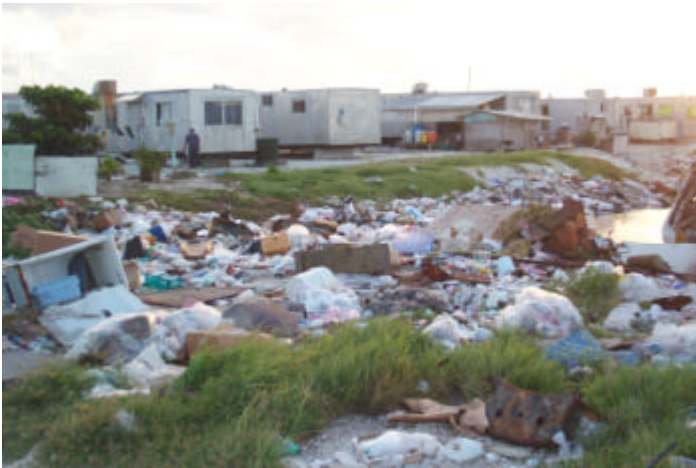
Figure 2: "North Camp" military caravans virtually on the Ebeye dumpsite

When the US military relocated Kwajalein's original inhabitants to Ebeye, the military constructed "Army Units" for their accommodation. As Ebeye's population grew residents added rooms to these units resulting in an overcrowded urban area existing of one-room shacks and lean-tos of plywood, tin and plastic sheeting. As a result of the high population density and limited availability of resources in addition to limited water supply and inadequate solid and sewage waste disposal, the occurrence of water-borne diseases became common. (Beatty, 2001)