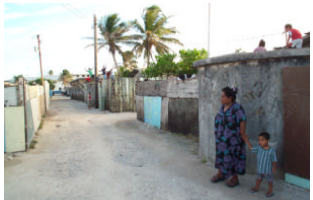
Figure 11: Ferro cement storage tanks in Ebeye streets