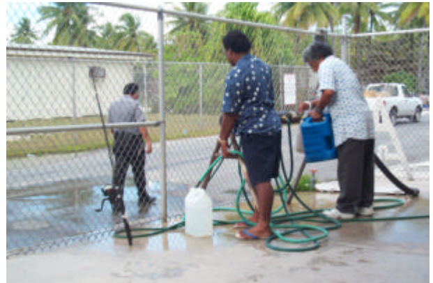
Figure 9: Water collection at Kwajalein Military base

Rainwater is sometimes collected from rooftop runoff into PVC or Ferro-cement water reservoirs. Tanks with a capacity of approximately 1000 gallon are available at local stores for 986 US $ per unit (Triple 3 Wholesale). Most roofs however, are not suitable for rainwater harvesting systems and gutters are totally lacking or not maintained.