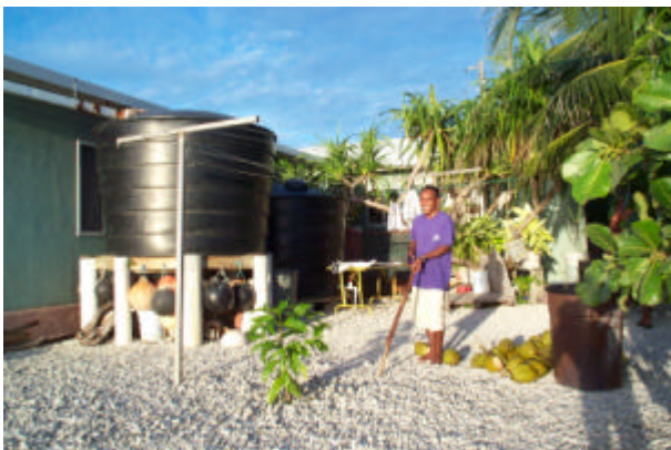
Figure 10: Rainwater harvesting on Ebeye still on a moderate scale

Rainwater is sometimes collected from rooftop runoff into PVC or Ferro-cement water reservoirs. Tanks with a capacity of approximately 1000 gallon are available at local stores for 986 US $ per unit (Triple 3 Wholesale). Most roofs however, are not suitable for rainwater harvesting systems and gutters are totally lacking or not maintained.