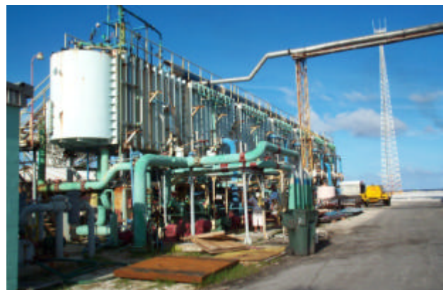
Figure 4: Multi effect distillation (MED) desalination system

The old system was a multi effect distillation (MED) desalination unit that was using the excess heat of the Ebeye power plant, which provided 180,000 gal/day into municipal supply, rationed to just two 35-minute periods per day. Repair of the MED system is apparently not feasible and the installation should be properly disposed of or sold to an interested party.