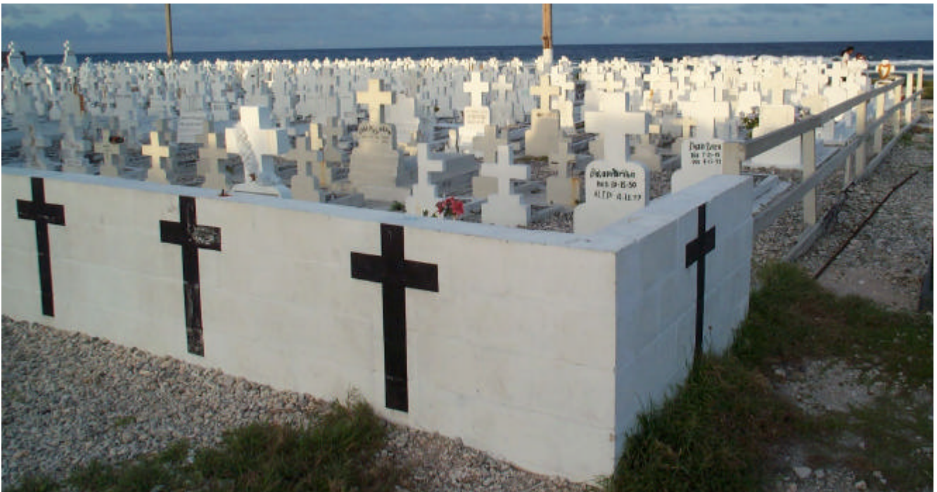
Figure 15: There is limited space for graveyards on Ebeye

The outbreak of cholera last year could only be confirmed after stool specimens had been analysed in reference laboratories in Guam and Honolulu. Restrictions on travel to Kwajalein Island, food exports and social gatherings were introduced. School lunch programmes were curtailed and burying of human remains was restricted.