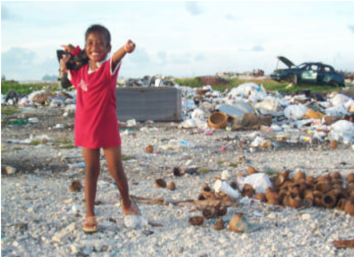
Figure 3: Children playing on Ebeye rubbish dump

When the US military relocated Kwajalein's original inhabitants to Ebeye, the military constructed "Army Units" for their accommodation. As Ebeye's population grew residents added rooms to these units resulting in an overcrowded urban area existing of one-room shacks and lean-tos of plywood, tin and plastic sheeting. As a result of the high population density and limited availability of resources in addition to limited water supply and inadequate solid and sewage waste disposal, the occurrence of water-borne diseases became common. (Beatty, 2001)