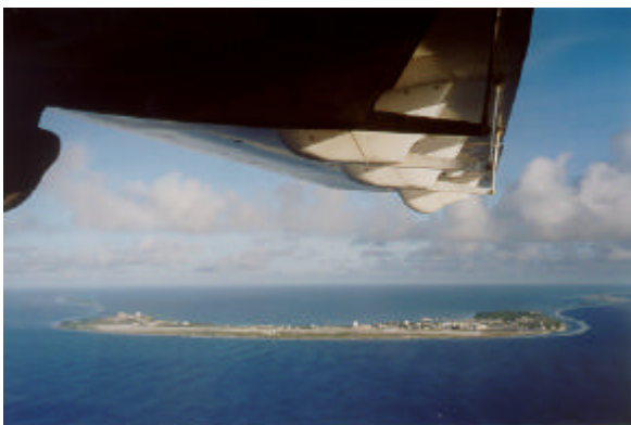
Figure 1: US Military base on Kwajalein Island

Kwajalein Island, 4 miles south of Ebeye, is leased to the United States military and is home to an extensive installation and military facilities established in 1951. Kwajalein is off limits for unofficial visitors except as a transit point to neighbouring Ebeye. In contrast, less than 2000 persons, consisting of US military personnel and contractors, are residing on Kwajalein Island (Patterson, 1986).